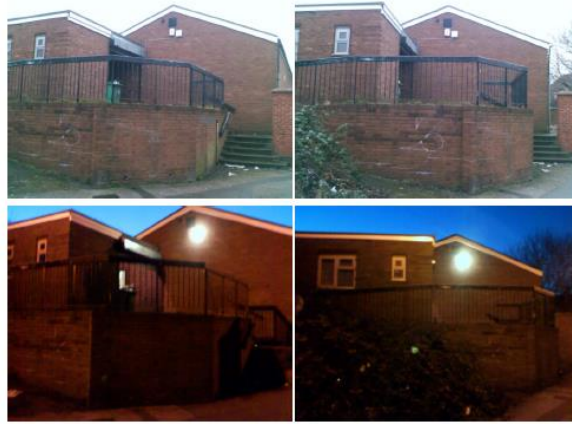
View of Scout Hall from the road.